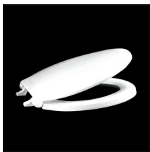
CFWC Closed Front With Cover