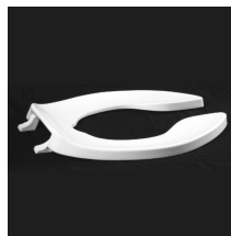
OFLC Open Front Less Cover