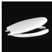
OFWC Open Front With Cover