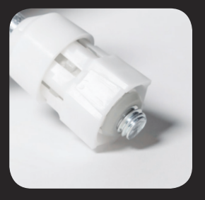
See our instructional video on YouTube